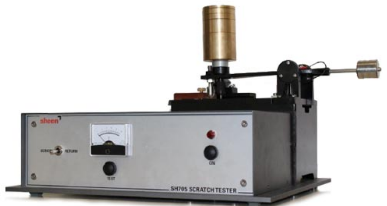
Mechanised Scratch Tester (SH705)

A plastic protective screen is available to avoid injury or intrusion into the mechanism or whilst instrument is activated.